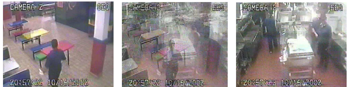
Figure 5. Two sequenced frames on either side of a blended frame

If the video was converted at the incorrect speed (example: conversion software) or captured at a speed different than the video card's refresh rate (example: screen capturing software) the resulting video can create blended frames (see Figure 5). The resulting video is an inaccurate and lower quality representation of the original recording.